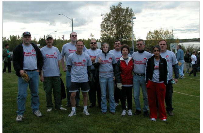
Some of the members of DOT's 2005 Corporate Challenge team