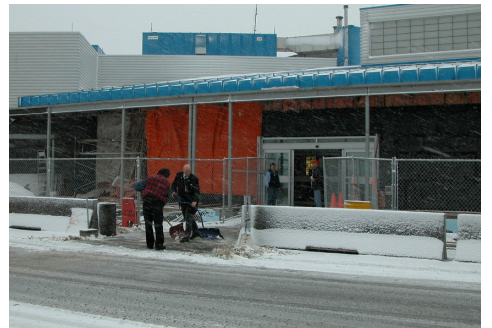
Preparations for the new revolving door at arrivals area

project have done a great job of coordinating activities in order to move the project forward and minimize impact on airport operations and users."