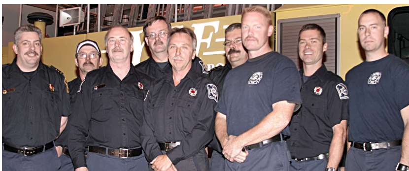
Yellowknife Airport Fire Department Award Recipients (L-R):