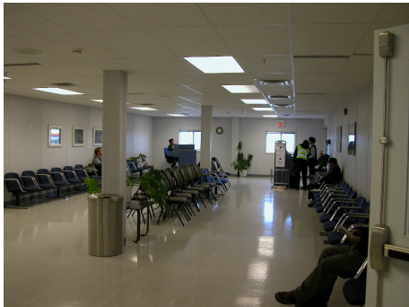
Non-secure departure lounge